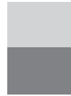
1/2 HORIZONTAL 7,83" X 5,41" + Bleed