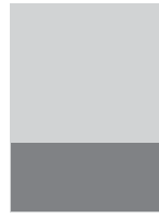
1/3 HORIZONTAL 7,83" X 3,61" + Bleed