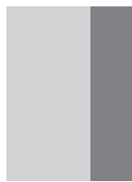
1/3 VERTICAL 2,66" X 10,75" + Bleed