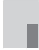
1/6 VERTICAL 2,66" X 5,42" + Bleed