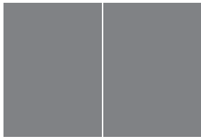
DOUBLE PAGE 15,66" X 10,75" + Bleed